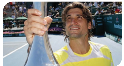
Venus Williams (USA) is coming to the ASB Classic while David Ferrer (Spain) is defending his crown at the Heineken Open